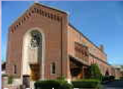
St. Charles Borromeo